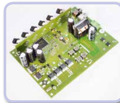
Power Supply / Light Interface: CS-INT100W