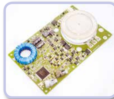
Gate Unit: GU-TH51