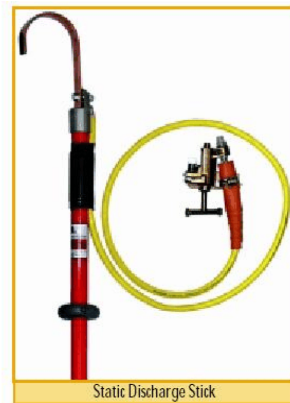
Our static discharge stick.

Static or Capacitive Discharge “Sticks” are available from North Star High Voltage at www.highvoltageprobes.com . These sticks are rugged devices for discharging anything which can store a charge. Protect your ears if you expect any discharge to occur.