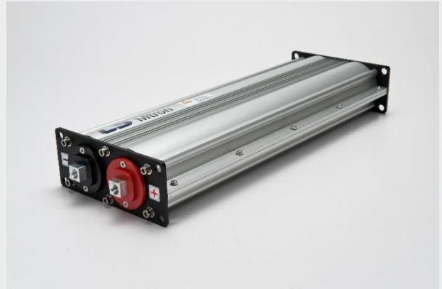
* This is an image for reference.

It can be applied in wind power, hybrid systems, industrial automation, power backup and stabilization. Imagination is its only boundary.