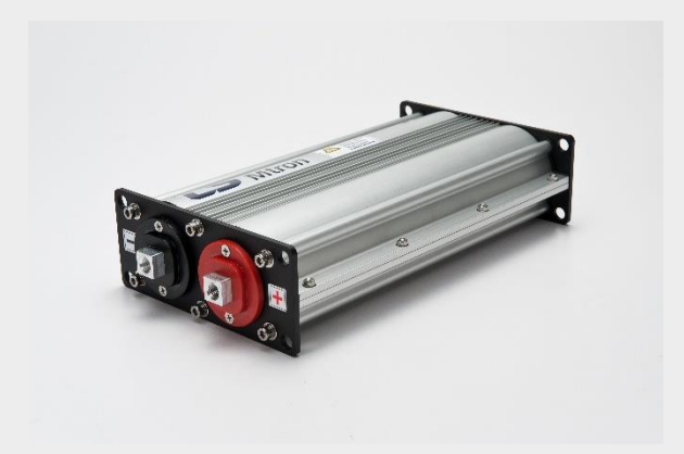
* This is an image for reference.

It can be applied in wind power, hybrid systems, industrial automation, power backup and stabilization. Imagination is its only boundary.